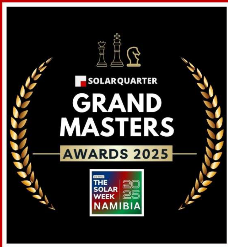
Grand Masters Awards