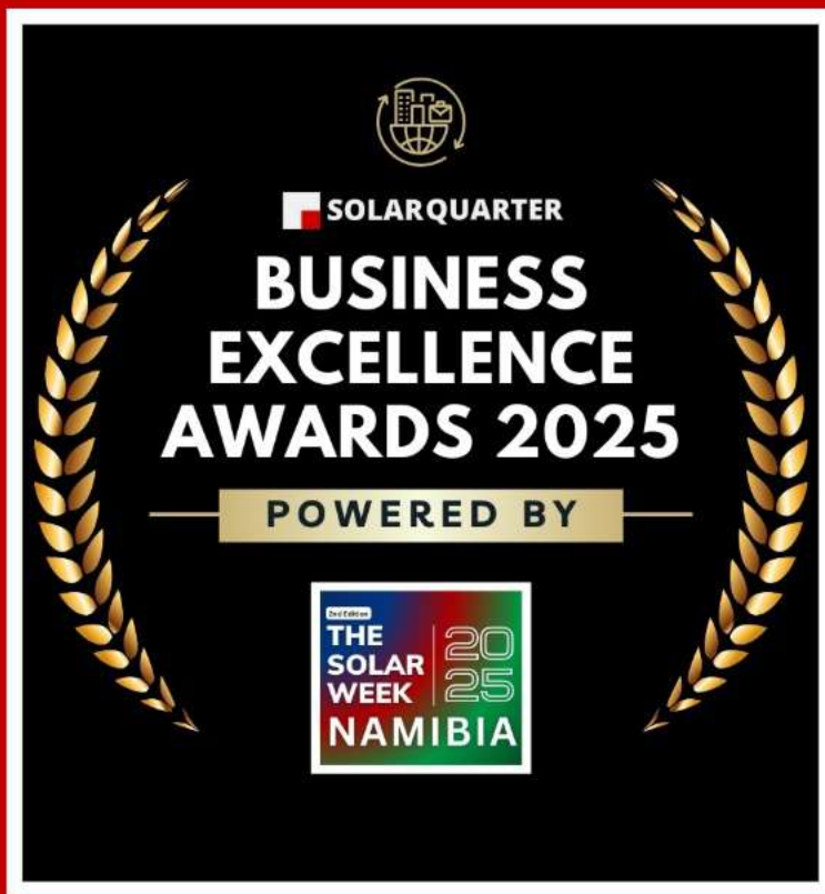
Business Excellence Awards