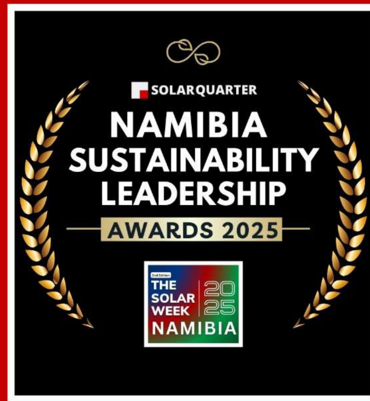
Sustainability Leadership Awards